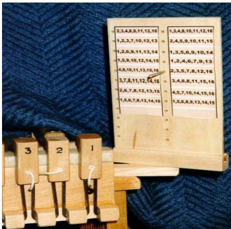
Positioned with extension on the bottom